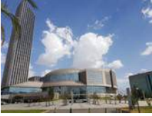
Postponement of the 37 th Session of the AUDA-NEPAD Heads of State and Government Orientation