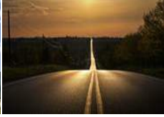
Africa's path to 2063