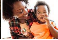
Nourishing Africa through improved nutrition and sustainable food systems