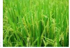
Côte d'Ivoire: Quest to become west Africa's rice bowl